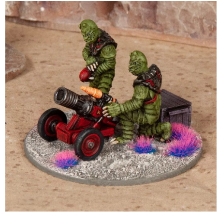
Neptonian Fiends descend from the skies as gun crews fire the deadly Gamma Howitzer.