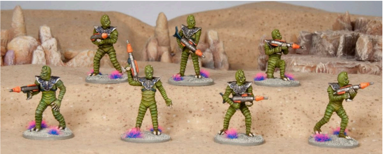
Neptonian Carnivore troops ready for the hunt!

30mm Pulp Sci-Fi Aliens by Khurasan Miniatures for use in Retro Raygun by Hydra Miniatures