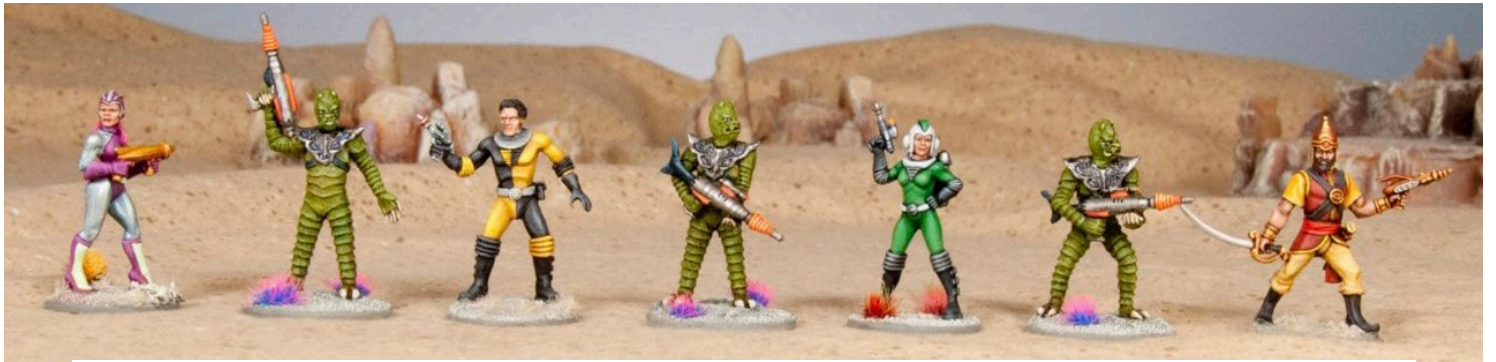
Size comparison between Neptonians (Khurasan) and Retro Raygun (Hydra)